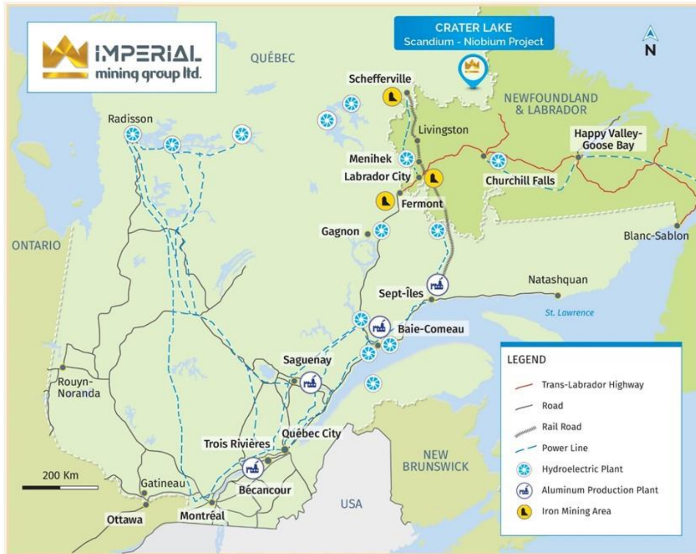
Figure 1 – Crater Lake Project Location Map, Quebec